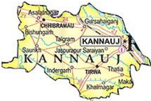
Map of Kannauj