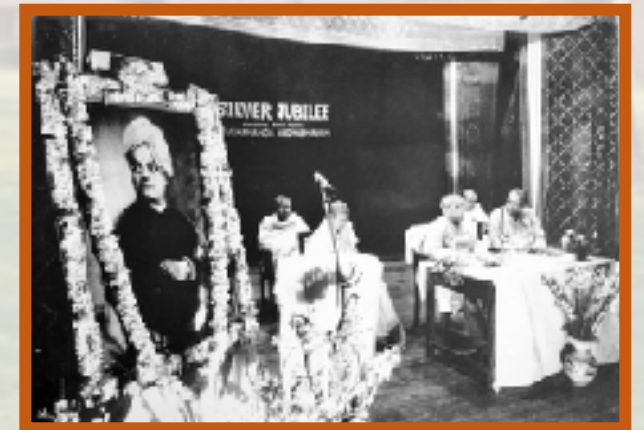
Silver jubilee Programme 1986