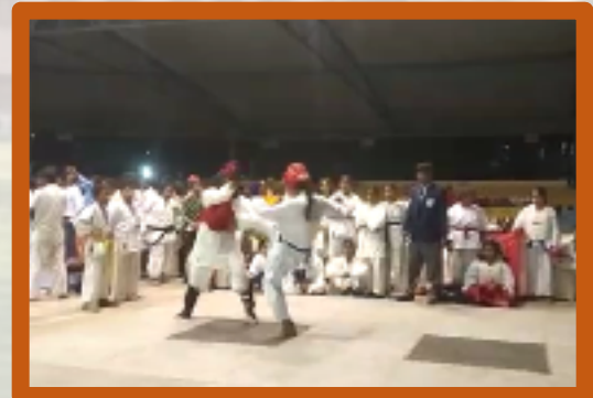
INTERNATIONAL KARATE COMPETITION