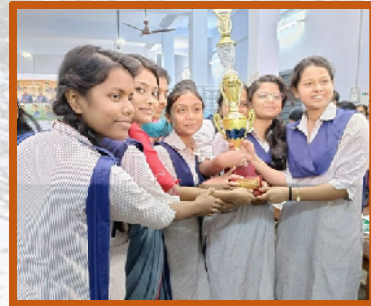
INTER-COLLEGE YOGA COMPETITION