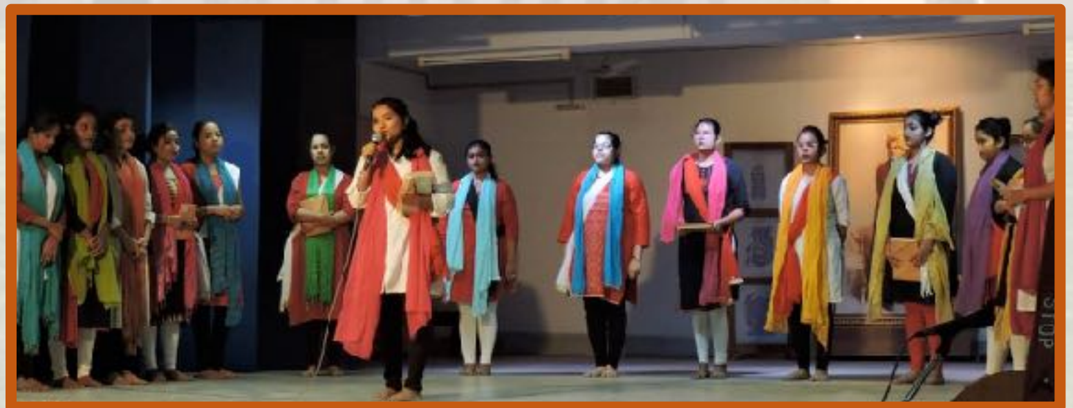
WOMENS' DAY CELEBRATION