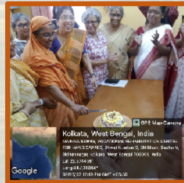
NEW CANTEEN INAUGURATION

A freshly renovated (with funds from RUSA 2.0) students' canteen with both outdoor and indoor seating facilities in the college premises has recently been opened for service. Quality food, tea, coffee, small meals and snacks are served from the canteen at a subsidized rate. The canteen is run by a voluntary self-help group named Saroj Nalini Self-help group. Students and staff can buy fresh cooked food at a reasonable rate. As per UGC rule junk food is banned in the canteen.