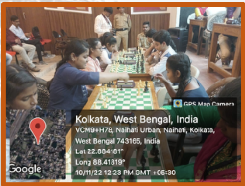
INTER-COLLEGE CHESS COMPETITION