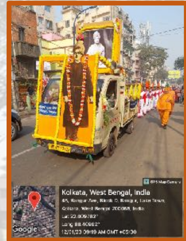
YOUTH DAY PROCESSION