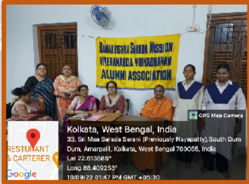
INAUGURATION OF AUDIO-BOOK CENTRE