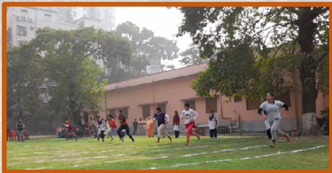
COLLEGE ANNUAL SPORTS