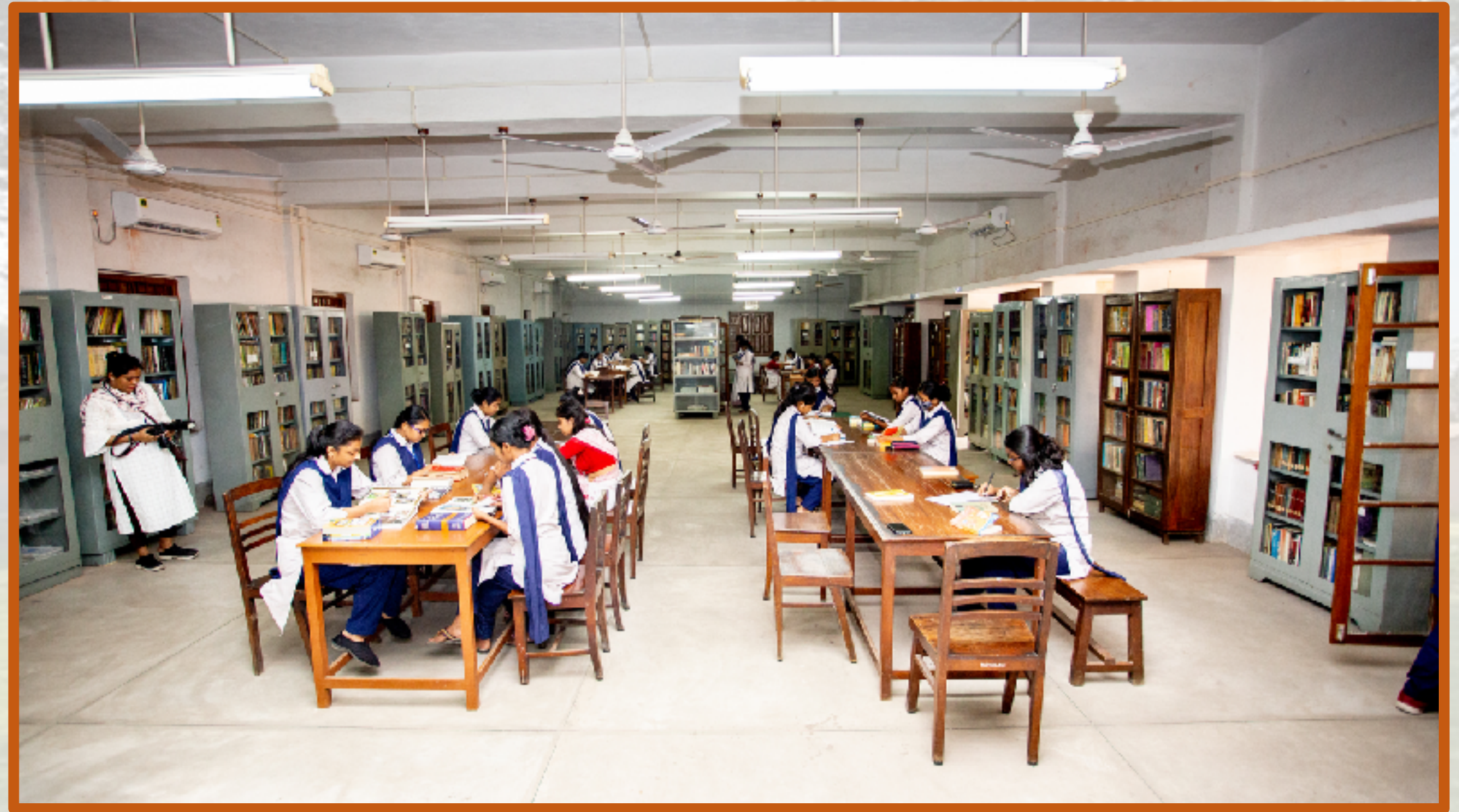
LIBRARY AT A GLANCE