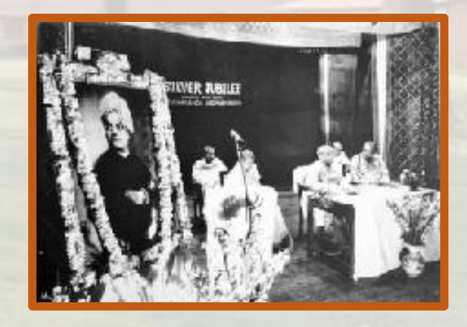
Silver jubilee Programme 1986