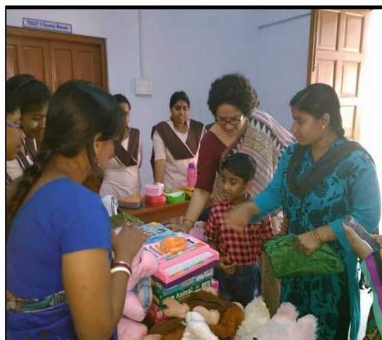
Ramakrishna Sarada Mission Vivekananda Vidyabhavan