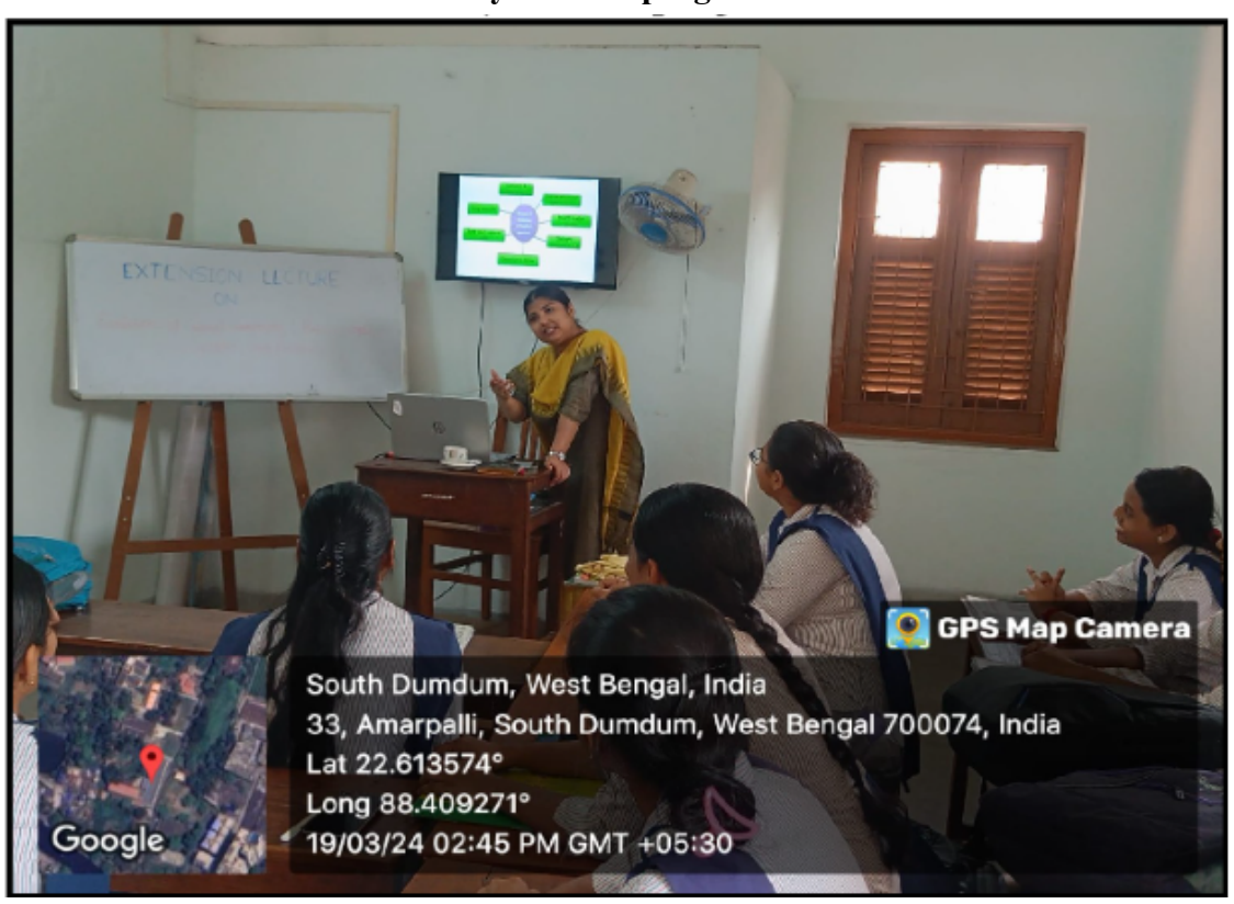
Flyer of the program