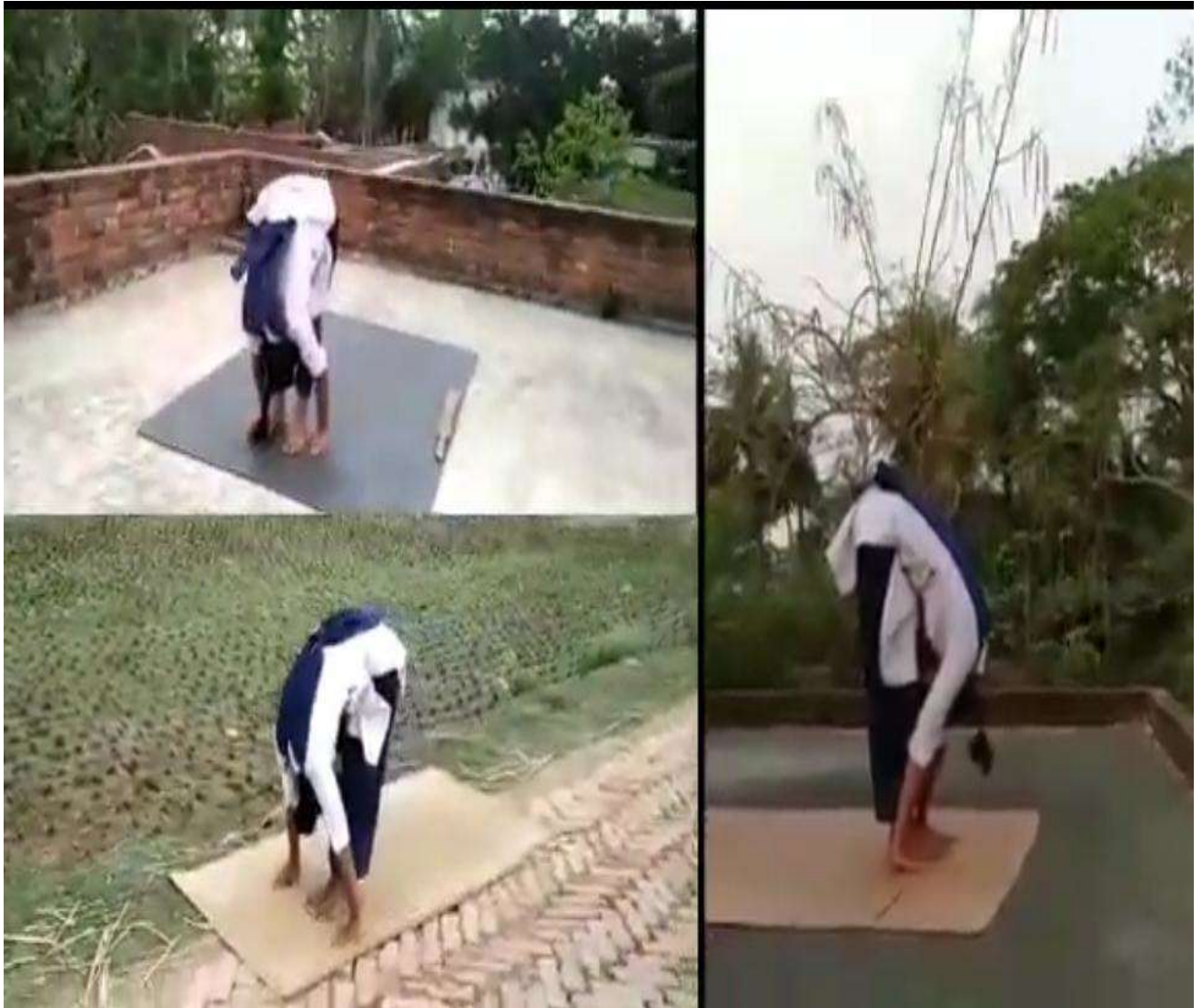
NSS volunteer was practising Yoga at home

33, SRI MAA SARADA SARANI, DUM DUM, KOLKATA- 700055 WEBSITE: www.rkmsvv.ac.in , Email: rksm.college@gmail.com , Phone: 033-2551 3452