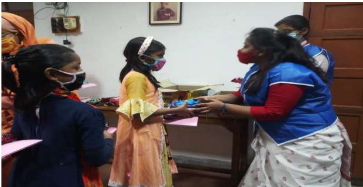
Kits were distributed among slum children by NSS volunteers