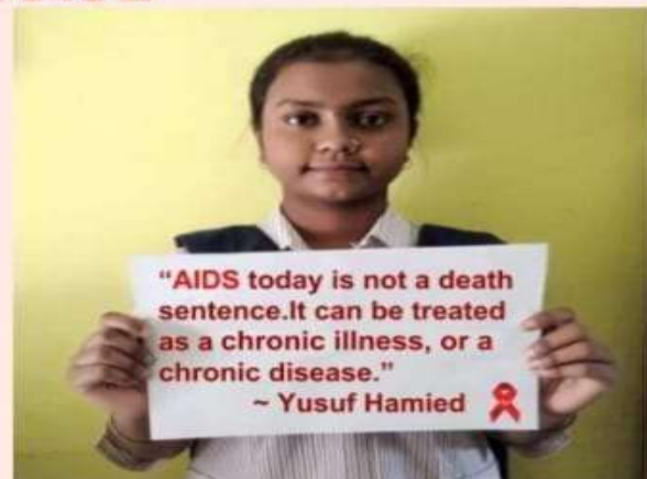
Photo collage made by NSS volunteers

7. Community Service on 26 th January, 2021