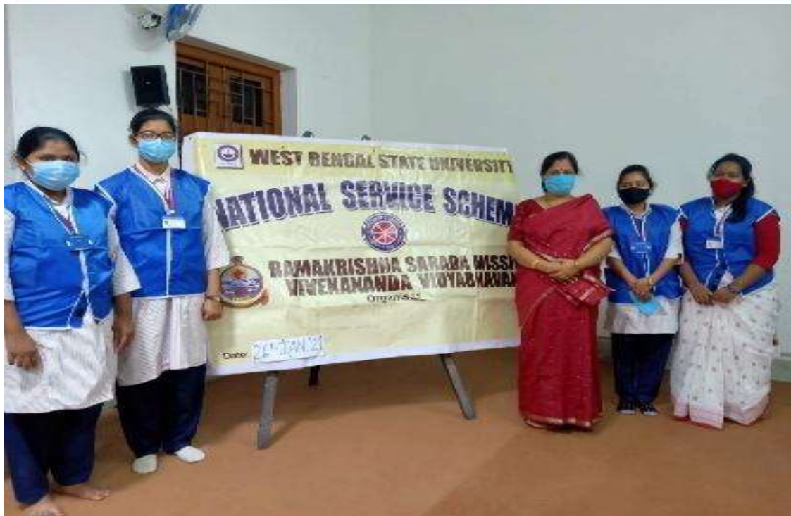
NSS volunteers and PO in the community programme on 26.01.21

33, SRI MAA SARADA SARANI, DUM DUM, KOLKATA- 700055 WEBSITE: www.rkmsvv.ac.in , Email: rksm.college@gmail.com , Phone: 033-2551 3452