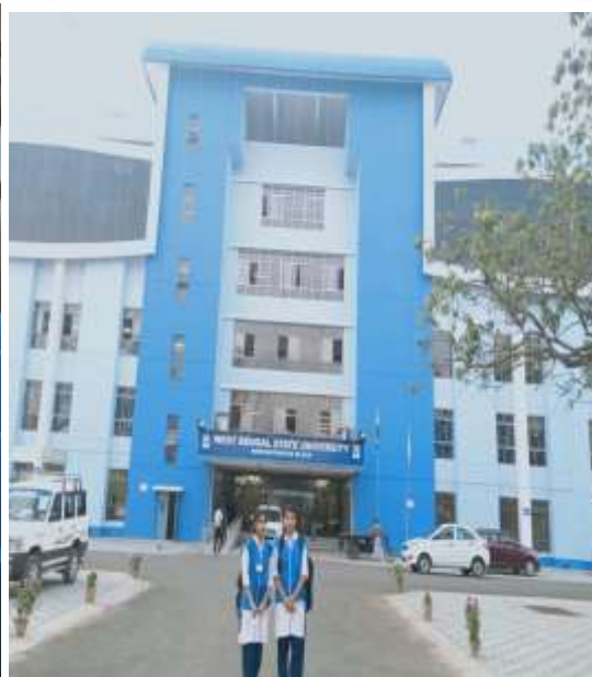
NSS volunteers at West Bengal State University on University Foundation Day