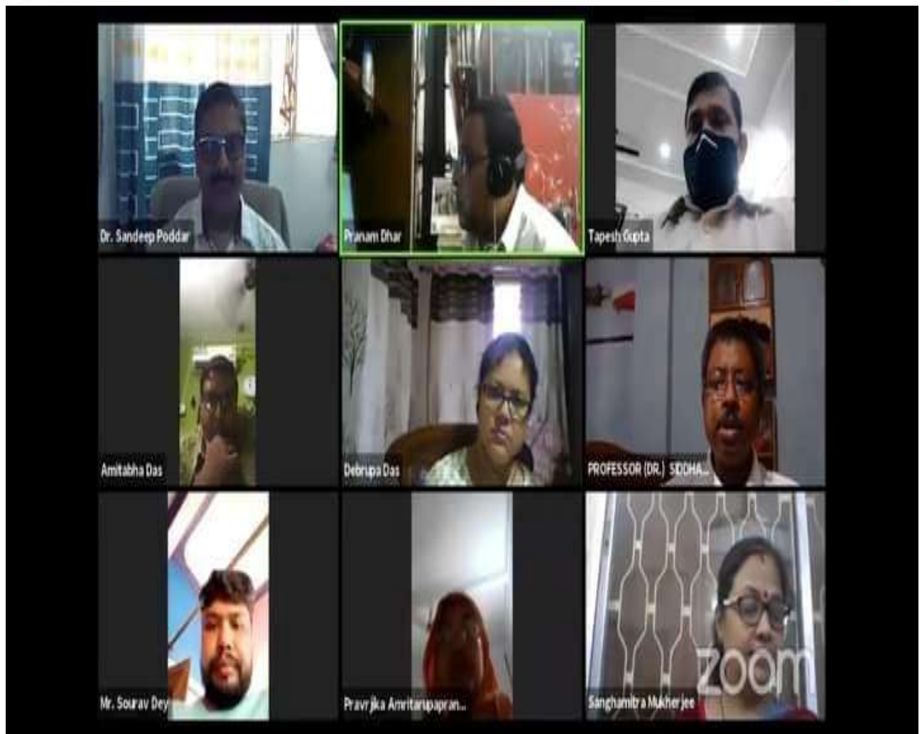
Participants of the Webinar

33, SRI MAA SARADA SARANI, DUM DUM, KOLKATA- 700055 WEBSITE: www.rkmsvv.ac.in , Email: rksm.college@gmail.com , Phone: 033-2551 3452