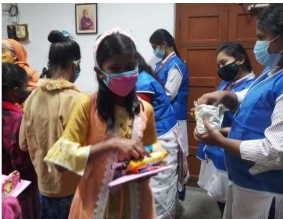
Kits were distributed among slum children by NSS volunteers