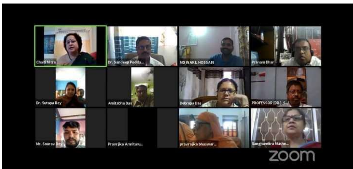
Participants of the Webinar