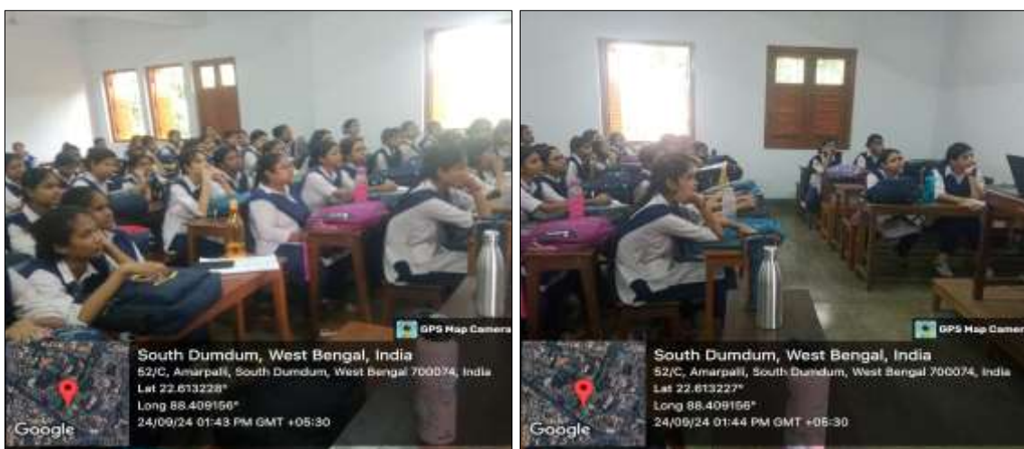
Participants of the programme