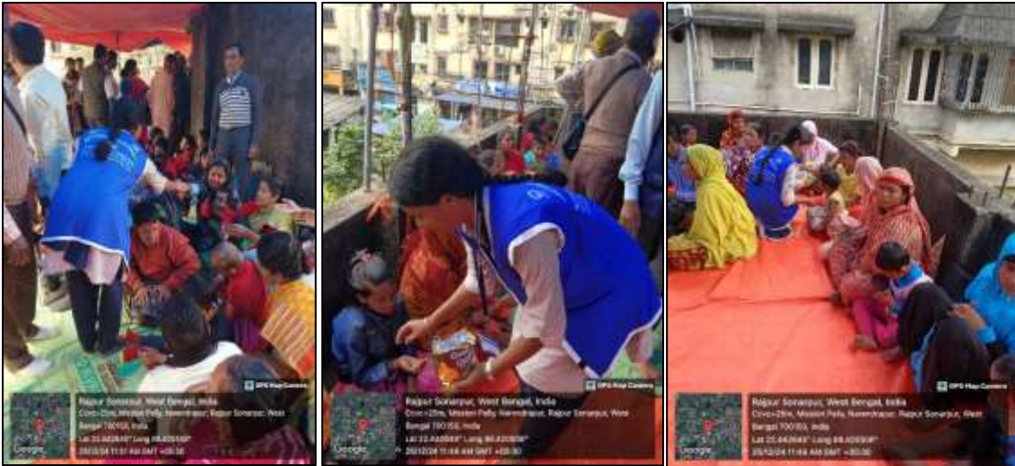
Foods were distributed by our NSS volunteers