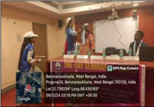
NSS PO was felicitated by NSS volunteers of WBSU