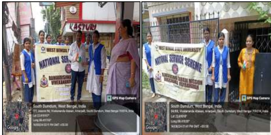
NSS PO & Volunteers at Har Ghar Tiranga Campaign

community to come together in celebration of India's independence and the enduring spirit of freedom.