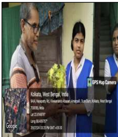
Plants distribution was being done by the NSS volunteers