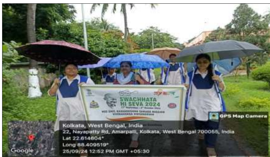
NSS PO & Volunteers at the Swachata Hi Seva Campaign

Moreover, the initiative successfully instilled a deep sense of environmental consciousness in the onlookers, encouraging them to adopt cleaner habits and become active participants in preserving the sanctity of nature. The event, thus, not only brought about a tangible positive change in the local surroundings but also served as a beacon of inspiration, urging others to follow in the footsteps of these dedicated volunteers and contribute towards the greater good of the environment.