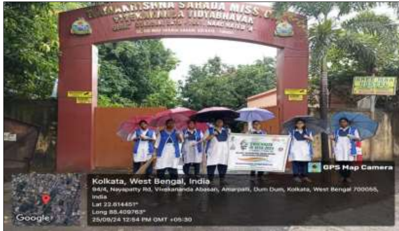
NSS Volunteers with the banner of Swachata Hi Seva Campaign