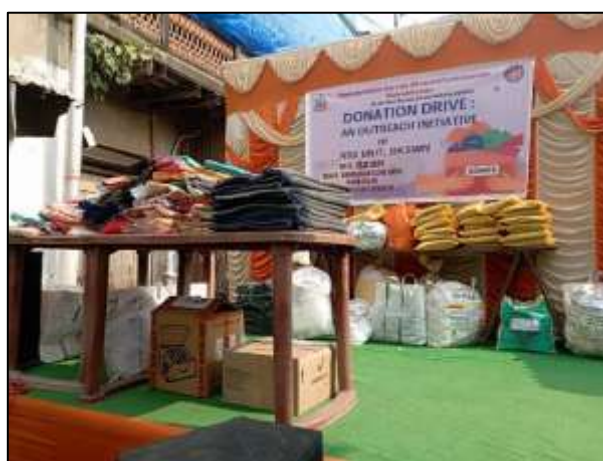
Banner of 'Donation Drive', outreach initiative

Recognizing the pressing needs of this community, RKSMVV has resolved to adopt a portion of Rambagan for sustained outreach efforts.