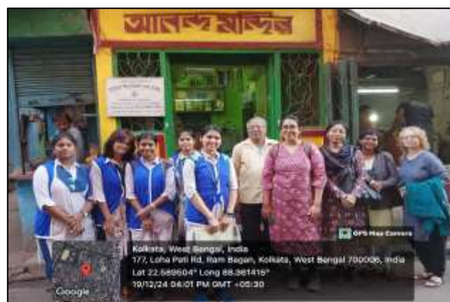
Picture of NSS volunteers and teachers, Sociology department; outside the Ananda Mandir(Local Club);located at Ram Bagan

Outcomes: This visit was meant to get a chance to come in touch with the socio-economic, health-hygiene and educational conditions of both the children of slum and red-light areas. Through this survey, students could understand the scenario of the city slum and red-light area. It will help the students to build an overall critical understanding about how the Govt. should intervene in formulating policies and arrange welfare programs beneficial to those of the kids. Students took full advantage of getting themselves exposed to new ideas and the social pattern of support systems and community networks. Overall, it was an enriching experience for all .