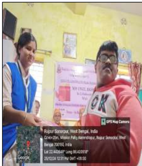
Blankets were distributed by our NSS volunteers