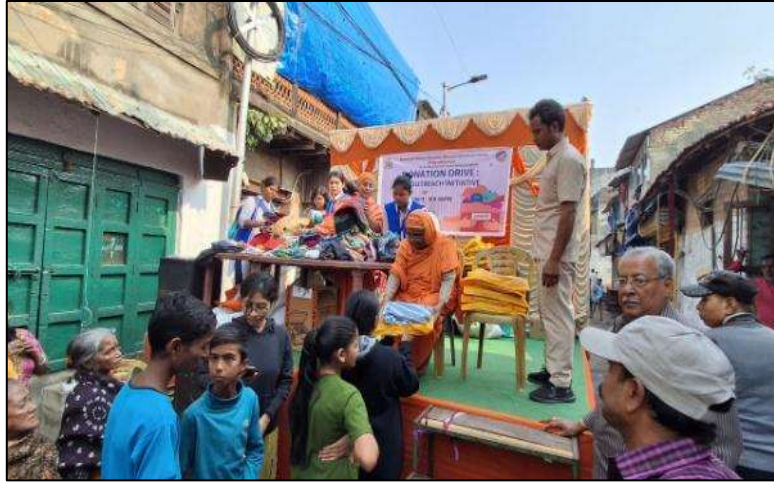
Few glimpses of Donation Drive initiative at Rambagan Slum area from the NSS volunteers and teachers, RKSMVV