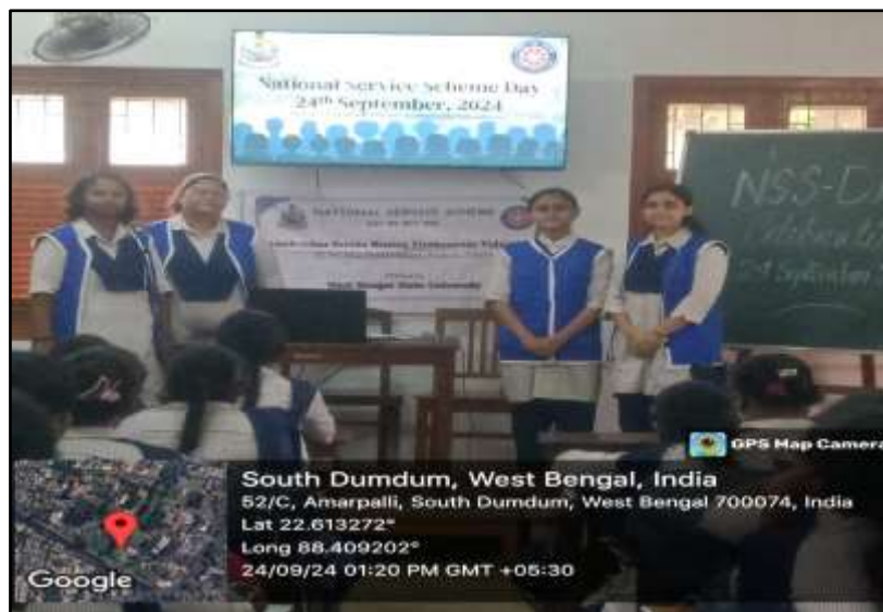
Celebration of NSS Day

The event culminated in a moment of solemnity and reverence as the NSS song filled the hall. Every attendee stood in unison, paying tribute to the spirit of service, unity, and dedication that defines the NSS movement. The celebration left an indelible impression on all present, inspiring a new generation to carry forward the noble legacy of the National Service Scheme with unwavering commitment and enthusiasm.