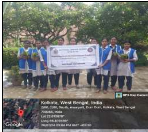
NSS Volunteers were holding the banner of 'Ek Ped Maa K Naam' initiative campaign