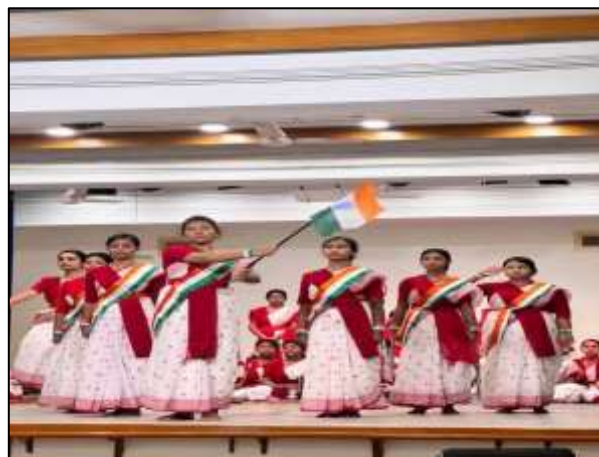
NSS volunteers were performing in cultural programme on Independence Day

5.Name of activity: Celebration of NSS Day