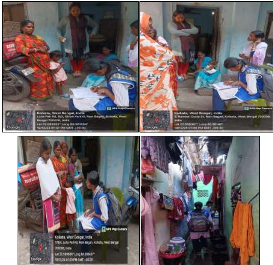
Students were doing survey regarding the lifestyle of the people and collected the data from them