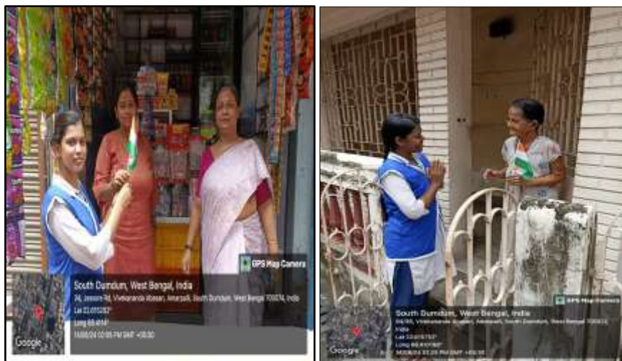
NSS volunteers distributed 30 Indian flags in the college's nearby locality