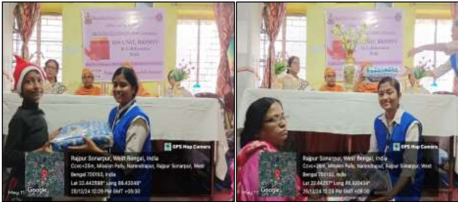
Blankets were distributed by our NSS volunteers