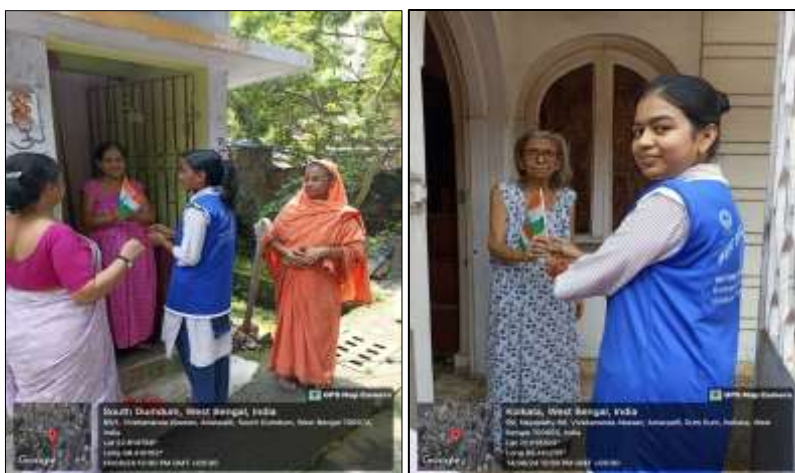
NSS PO & volunteers distributed 30 Indian flags in the college's nearby locality