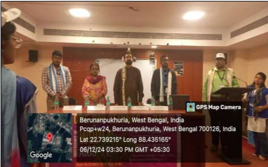
NSS PO along with VC ,WBSU and other dignitaries