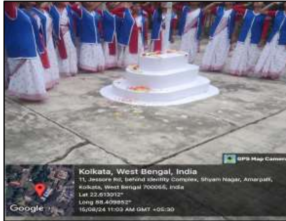
Flag hoisting ceremony