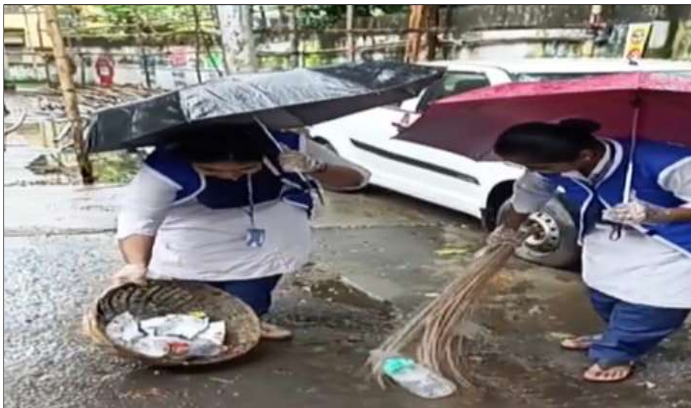
Plastic garbage cleaned by NSS Volunteers