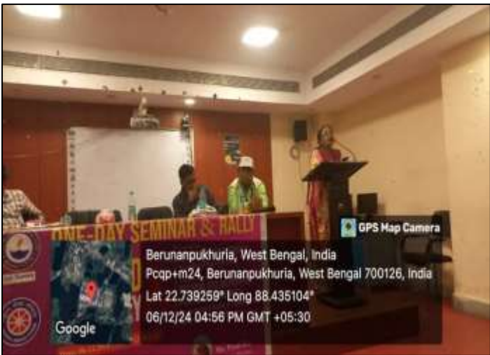
NSS PO was delivering lecture at the seminar