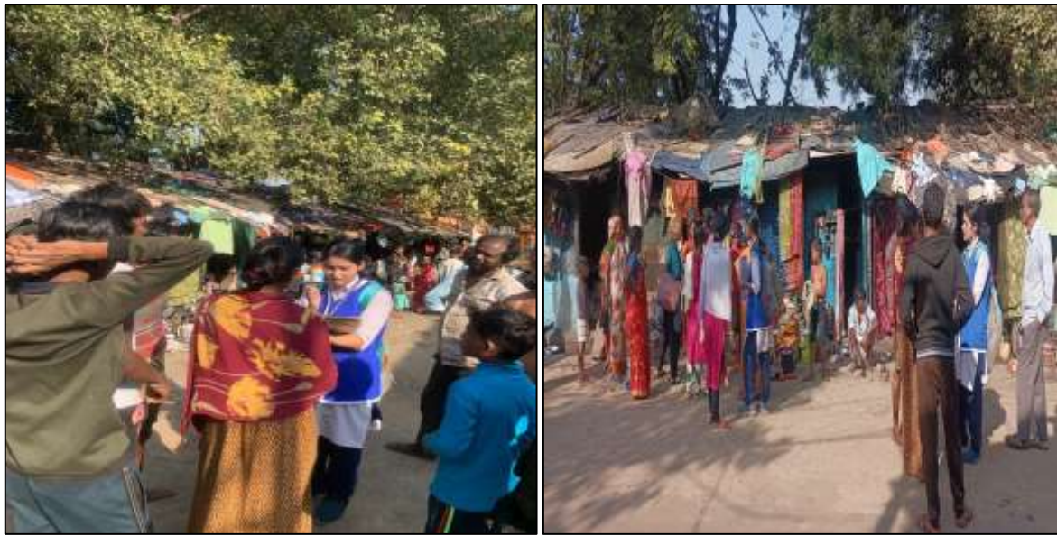
Students of Sociology department communicated with slum and red-light area kids located at Ram Bagan