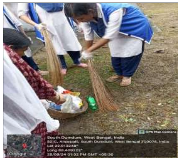
Plastic garbage cleaned by NSS Volunteers