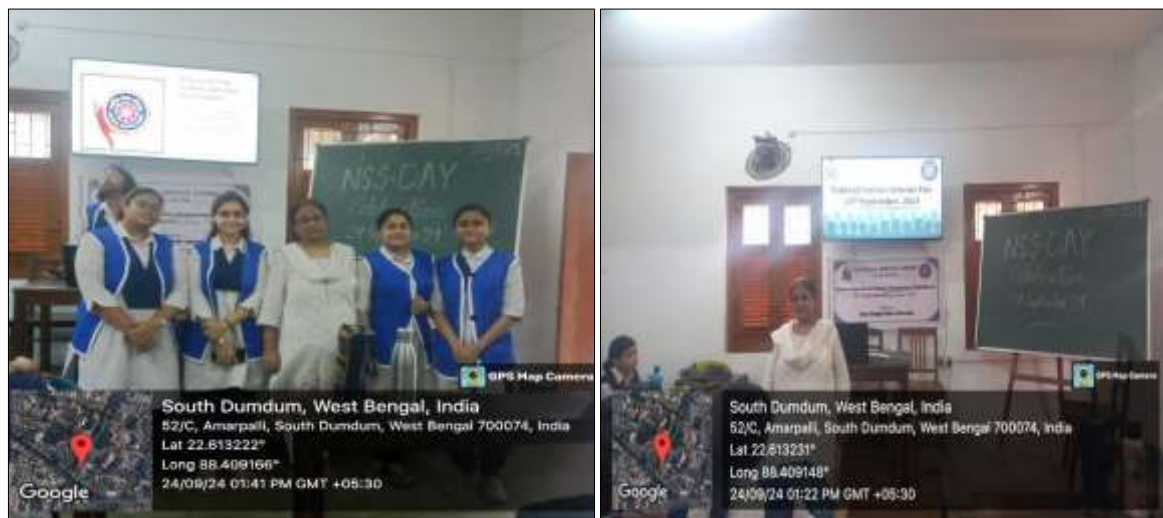
NSS PO & Volunteers at the orientation programme