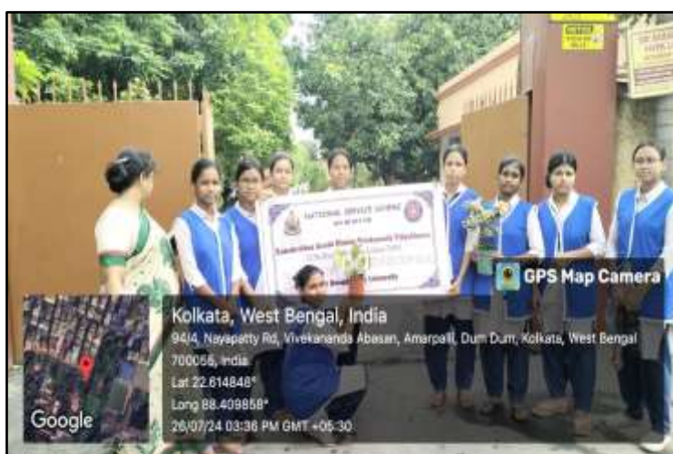
NSS PO & Volunteers were at 'Ek Ped Maa K Naam' initiative campaign

2.Name of activity: Har Ghar Tiranga Campaign