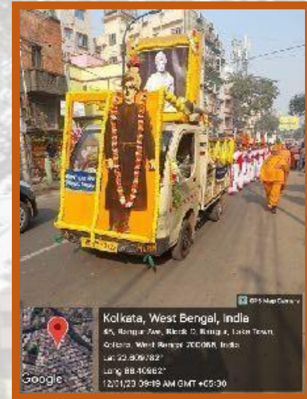
YOUTH DAY PROCESSION