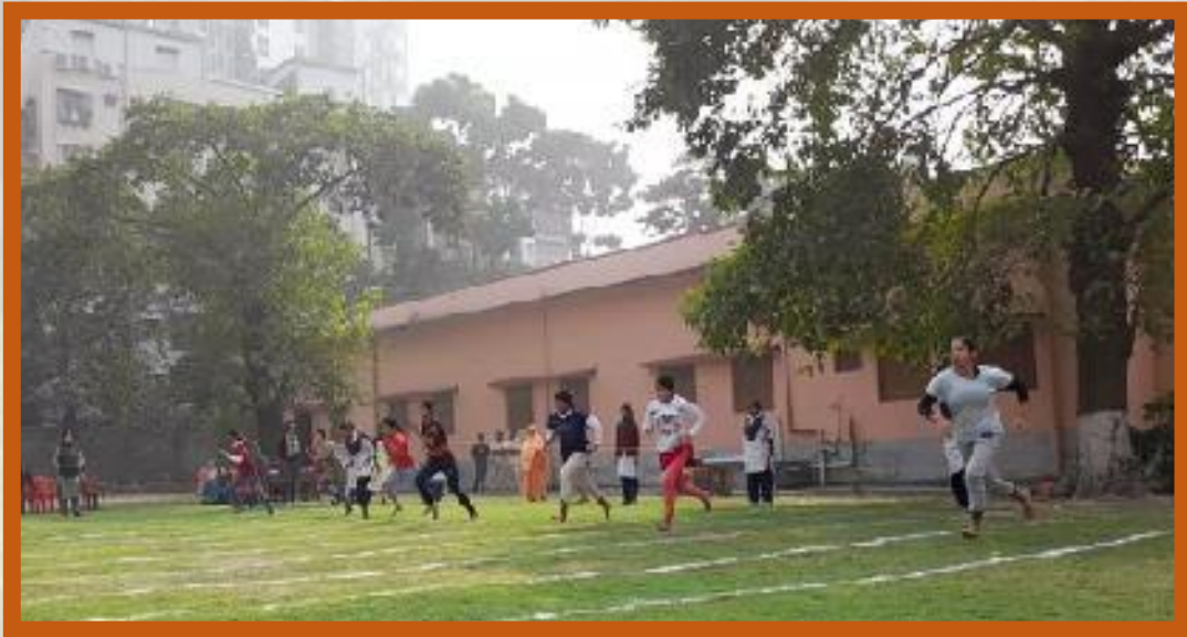
The College Annual Sports