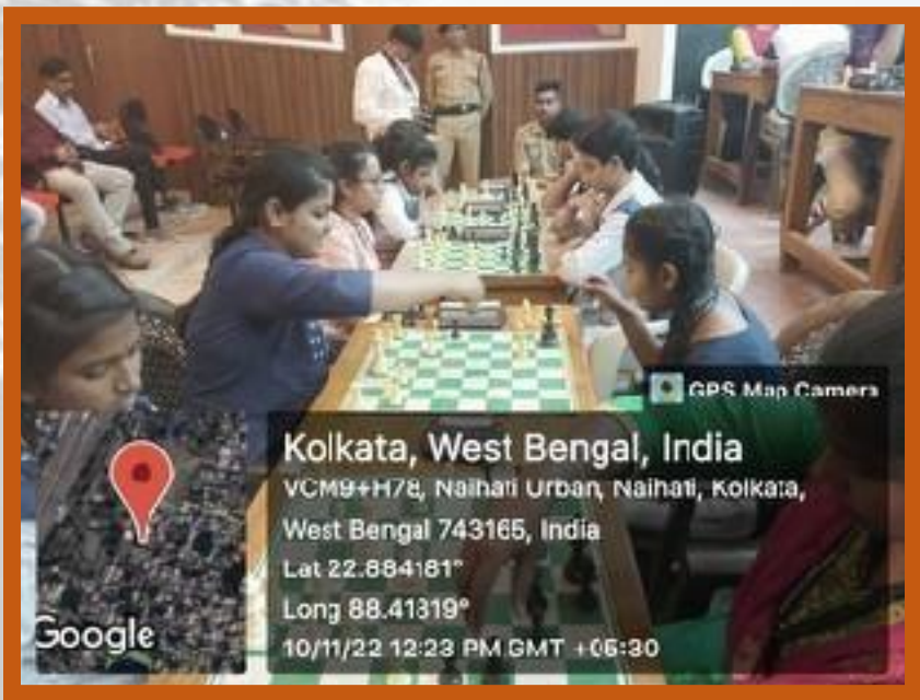
INTER-COLLEGE CHESS COMPETITION