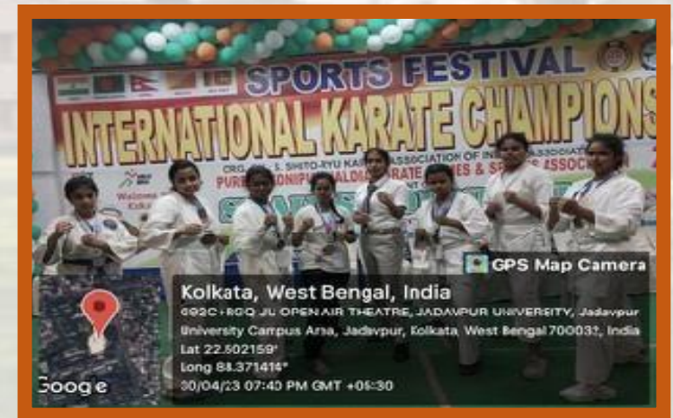
INTERNATIONAL KARATE COMPETITION