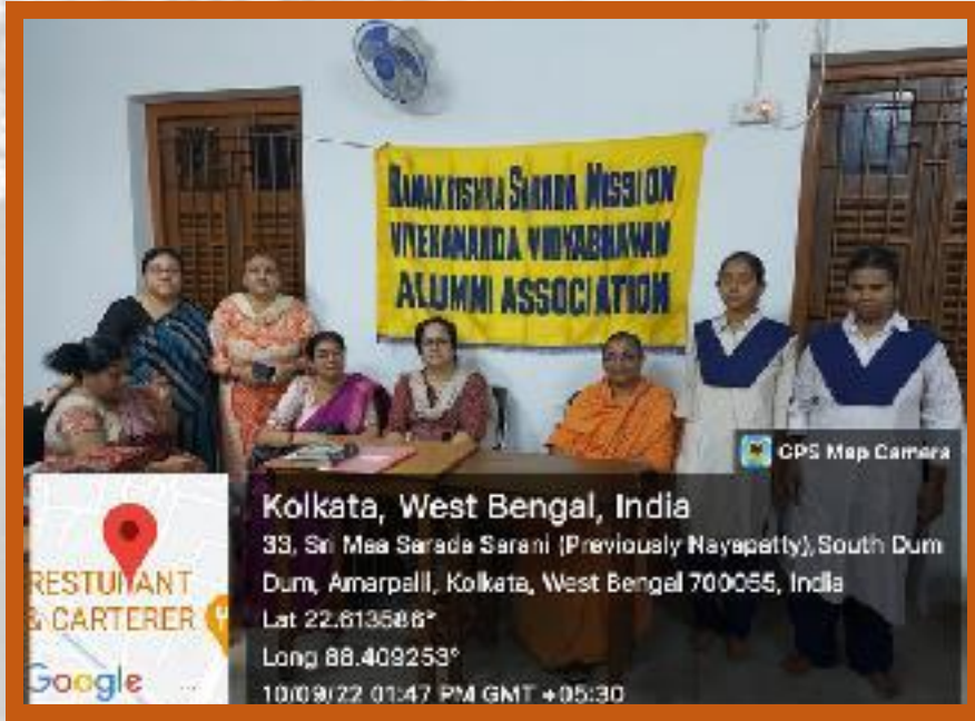
INAUGURATION OF AUDIO-BOOK CENTRE