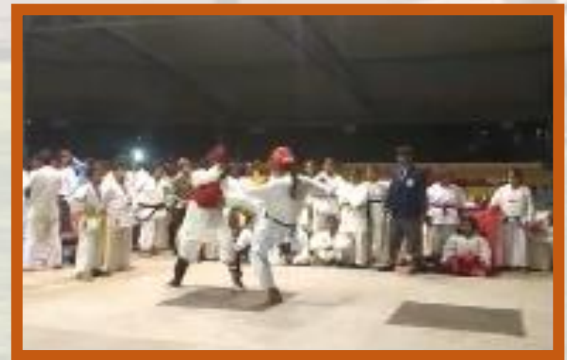
INTERNATIONAL KARATE COMPETITION