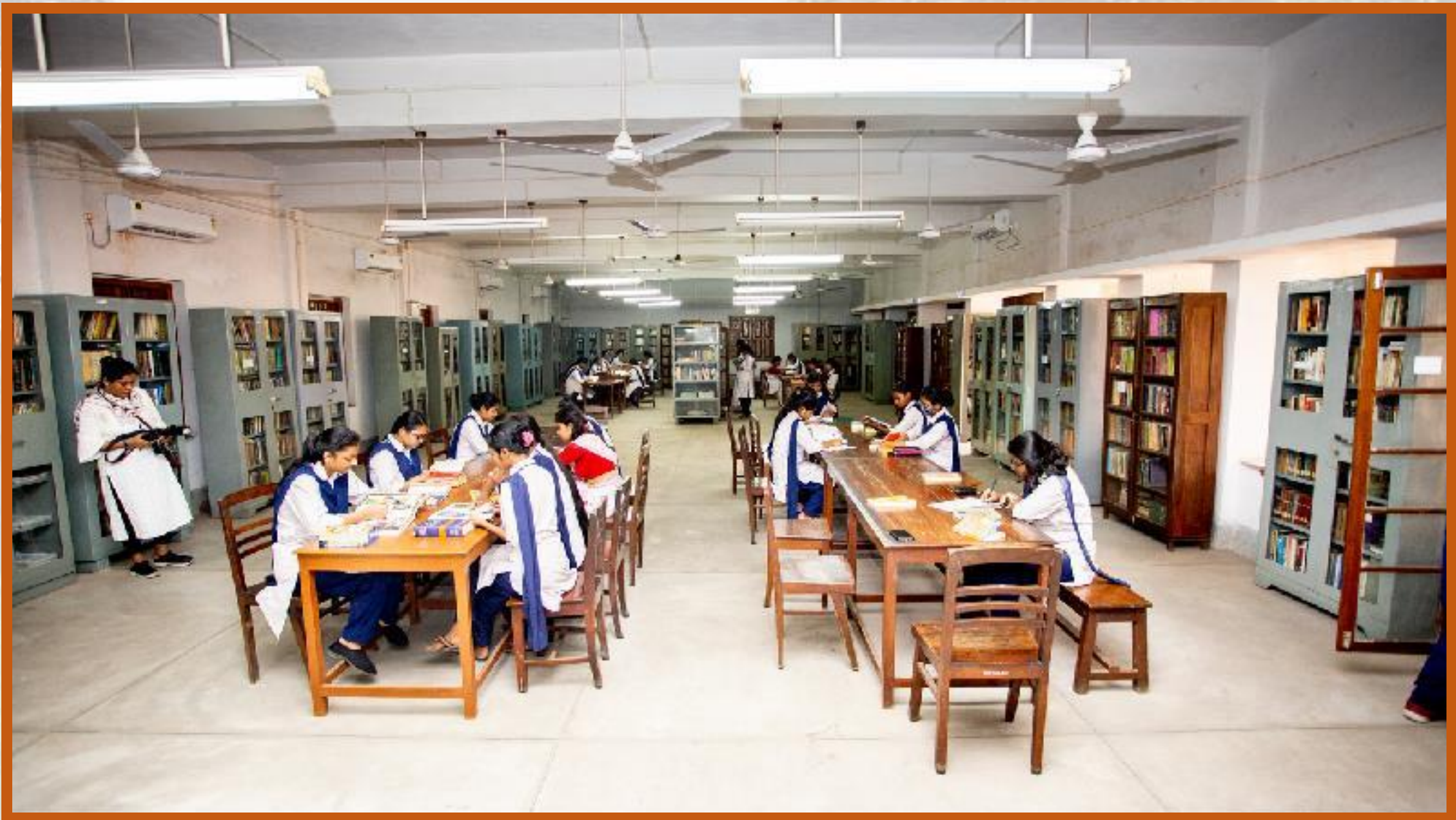
LIBRARY AT A GLANCE