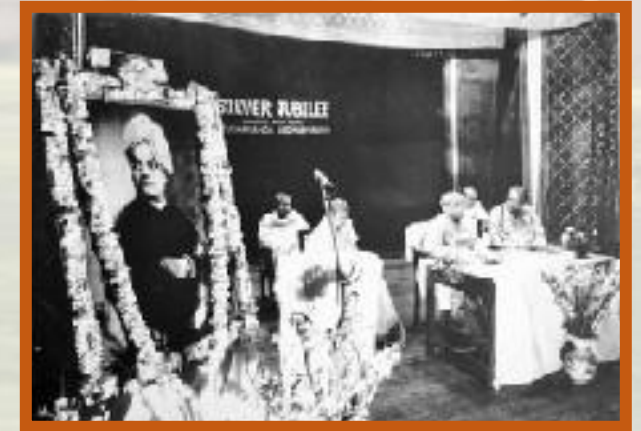
Silver jubilee Programme 1986