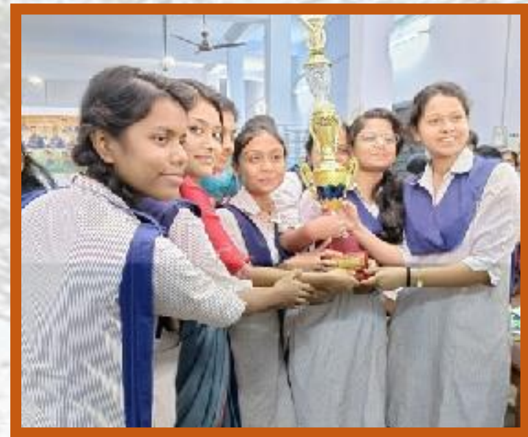
INTER-COLLEGE YOGA COMPETITION