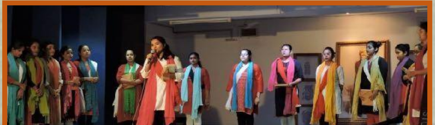
WOMENS' DAY CELEBRATION