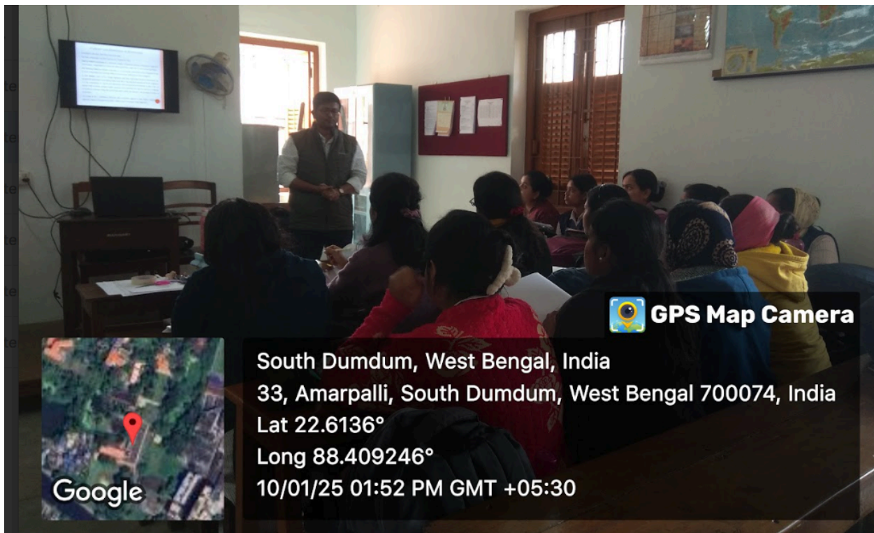
Some glimpses of the programme .....