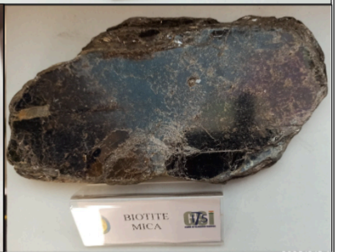
Different types of rock forming minerals at GSI, Kolkata