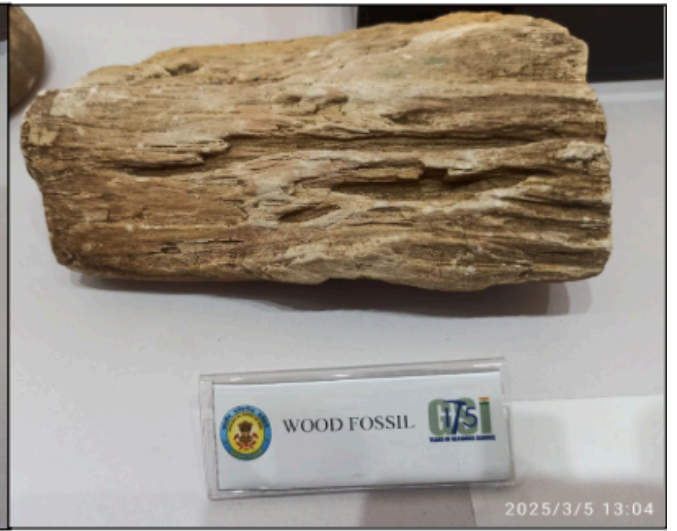
Leaf fossil and Wood fossil at GSI