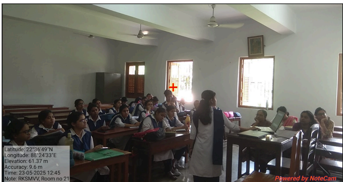
Some glimpses of the programme