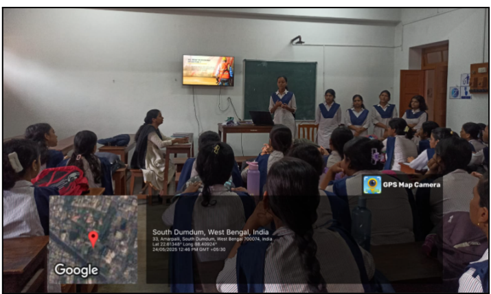
Some glimpses of the programme