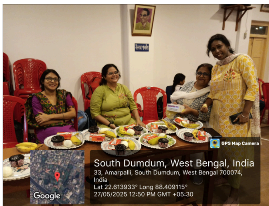
Some glimpses of the program