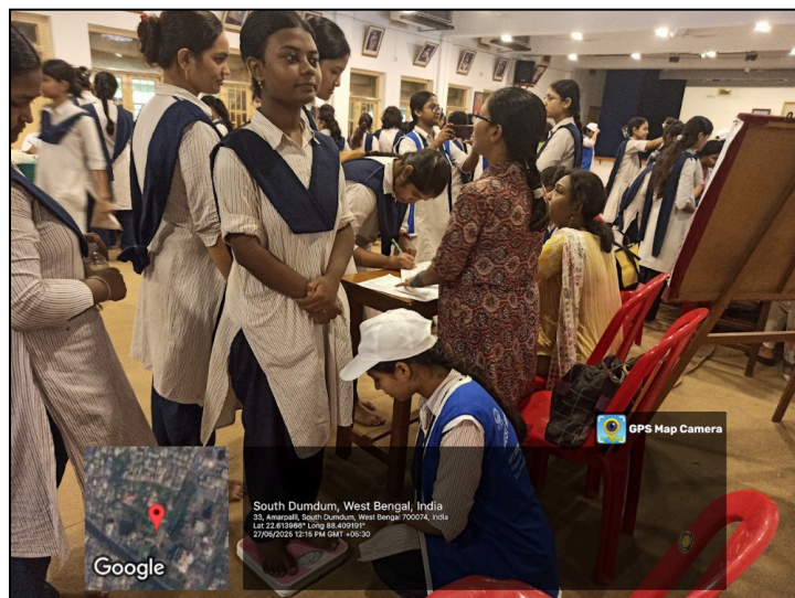
Some glimpses of the program