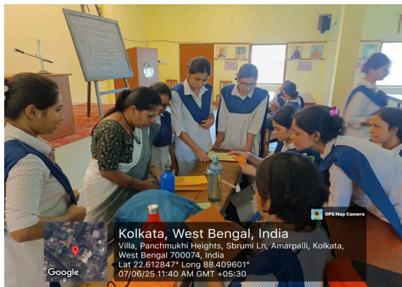
Kolkata, West Bengal, India Villa, Panchmukhi Heights, Sbrumi Ln, Amarpalli, Kolkata, West Bengal 700074, India Lat 22.612847° Long 88.409601° 07/06/25 11:40 AM GMT +05:30