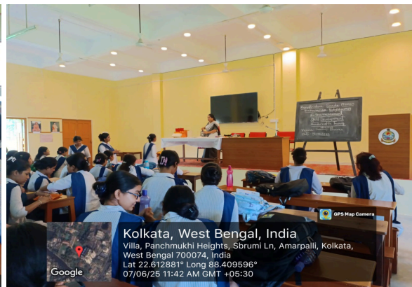
Kolkata, West Bengal, India Villa, Panchmukhi Heights, Sbrumi Ln, Amarpalli, Kolkata, West Bengal 700074, India Lat 22.612881° Long 88.409596° 07/06/25 11:42 AM GMT +05:30