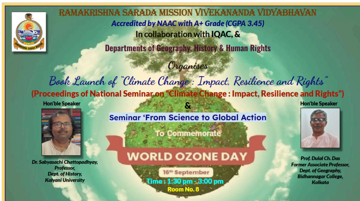
Flyer of the Program