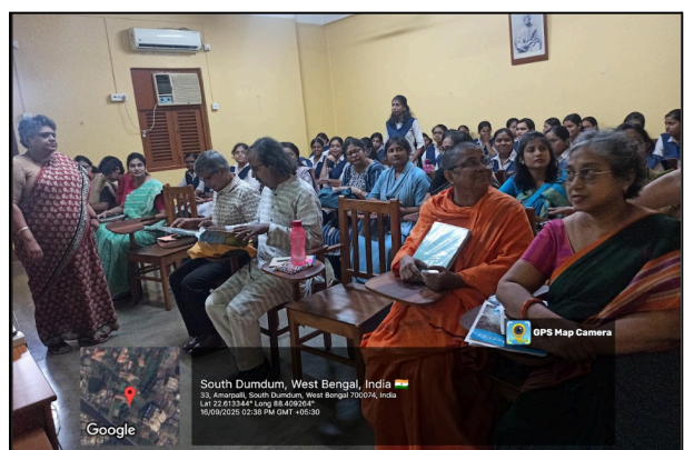
Some glimpses of the program