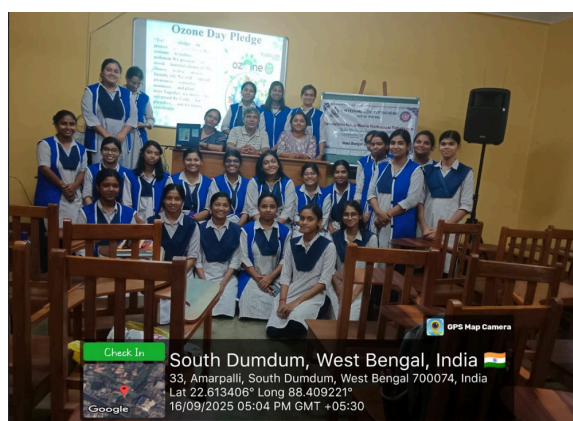
Some glimpses of the program