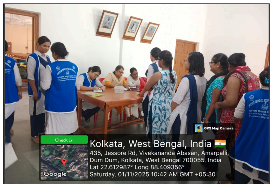
Some glimpses of the program