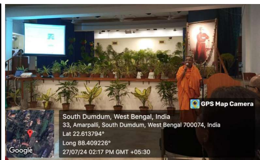
Inaugural Speech of Principal