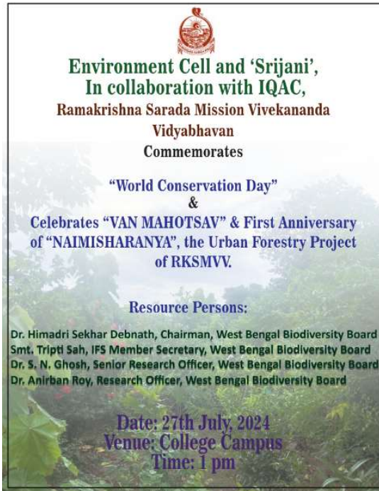
Flyer of the programme

9. Skill Development: Students may learn practical skills, like sapling care and tree maintenance.