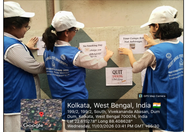
Some glimpses of the programme