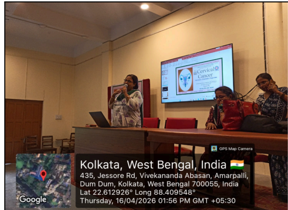
Some glimpses of the programme